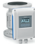
IMT31A Compact 0°-version