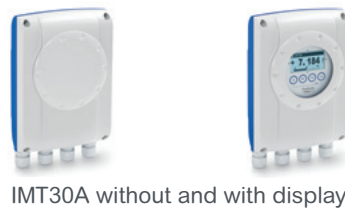
IMT30A without and with display