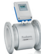
IMT31A Compact 45°-version